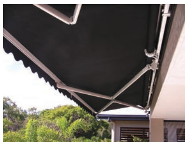
Amount of pitch available with the adjustable pitch control option